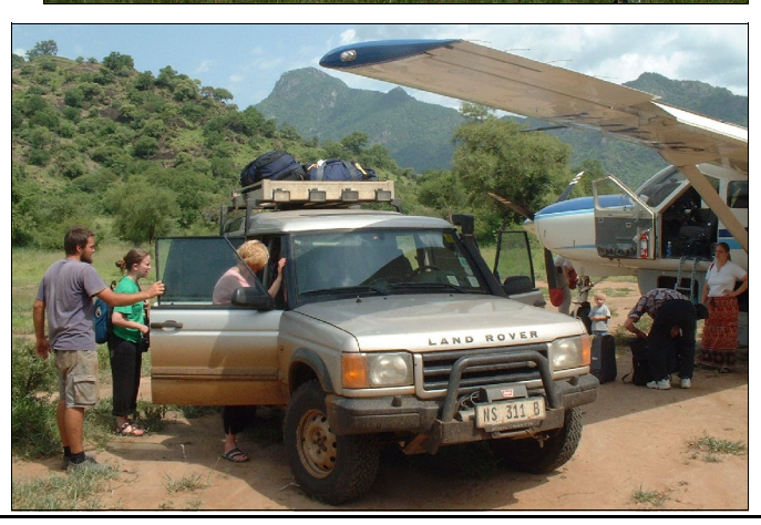
Arrival by AIM Air, & transportation by resident missionaries