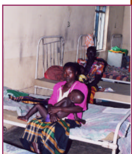
Pediatrics ward at the Christian "Safe Harbor" rural clinic at Midigo, NW Uganda. The area is 95% Muslim. Notice no electrical plugs.

Our earthly security is less important than our