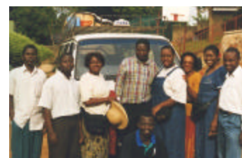
Four 1999 Team Members en route to Luwero, Uganda, with co-workers

Our big objective this year is to plant a church at Kajjansi during the week of September 10-17th. Lookout Mountain Presbyterian Church has contributed $6,000.00 to buy land and construct the basic concrete, brick and steel sanctuary. The land is already purchased. Five hundred dollars has also