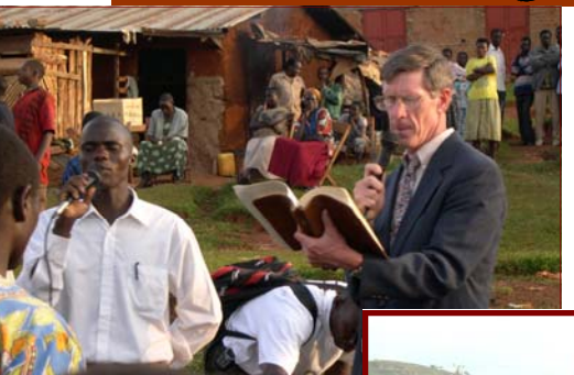
We preached, with able interpreters, in an area known for drunkenness.