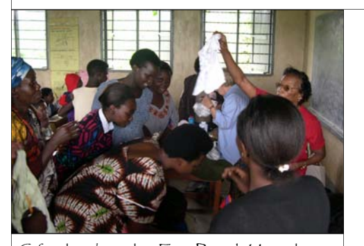
Gifts distributed at Fort Portal, Uganda