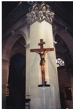
One of many crucifixes found in the Notre Dame in Paris.

All throughout this portfolio you have seen the fleur-de-lis “flower of the lily”. It is a symbol that I am very familiar with. Everywhere you go in Saint Louis you will see the fleur-de-lis. It was not until I went to France when I made the connection of the meaning of the fleur-de-lis and its meaning to Saint Louis. The fleur-de-lis is associated with the royal house of France. In French legend it symbolizes perfection, life, and light. Historians argue that either King Louis VI or King Louis VII first wore the fleur-de-lis on his shield. The English later used the symbol in their efforts to legitimize their claims to the French throne. Today the fleur-de-lis is a symbol of French nationalism and pride. For Saint Louis it is symbol of our French heritage.