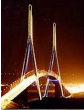
A night view of the Pont du Normandie "Normandy Bridge" as it stretches over the Sienne River in Normandy.