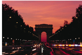
The busy Champs Elysees in Paris, France, at dusk with the Arc De Triomphe in the background.