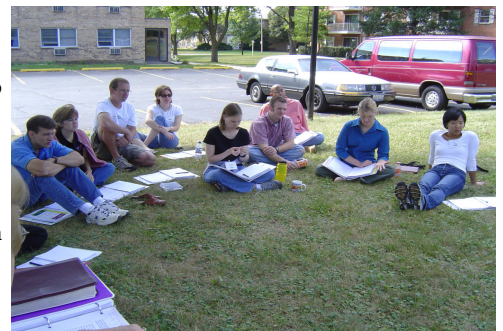
Some of the newest appointees of TEAM going through Phase 2 training at TEAM headquarters in September 2004.

In 1881 Franson left for Sweden to minister. While serving in Europe he heard Hudson Taylor challenge people to go to China with the gospel. Upon hearing Taylor speak, Franson had a vision of creating mission sending agencies into various European countries. When Franson, arrived back in America, he was motivated to create a class that trained people for cross-cultural missions. His first class was held on October 14, 1890, the official birthday of TEAM. The early name for TEAM was "The Scandinavian Alliance Mission." This name reflected Franson's and reflects TEAM's vision to bring churches together into an alliance enabling even small congregations to have a part in sending out missionaries.